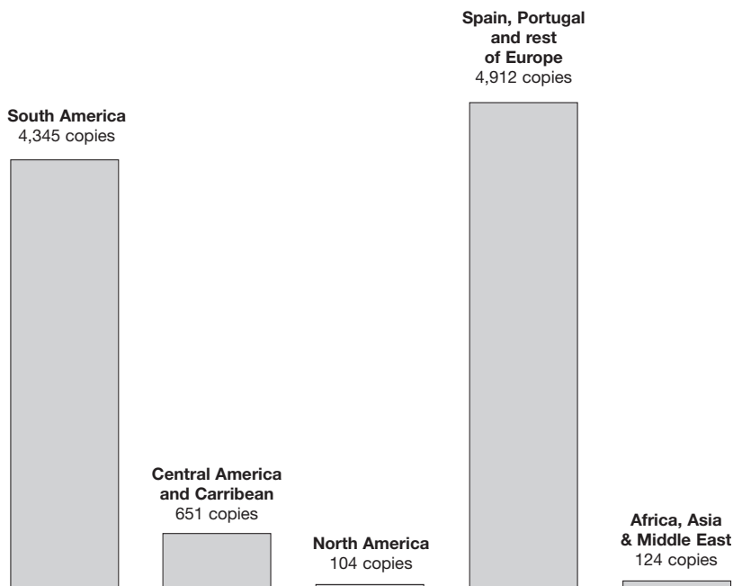
Geographical Breakdown by Regions and by Countries Grand Total 10,136 copies